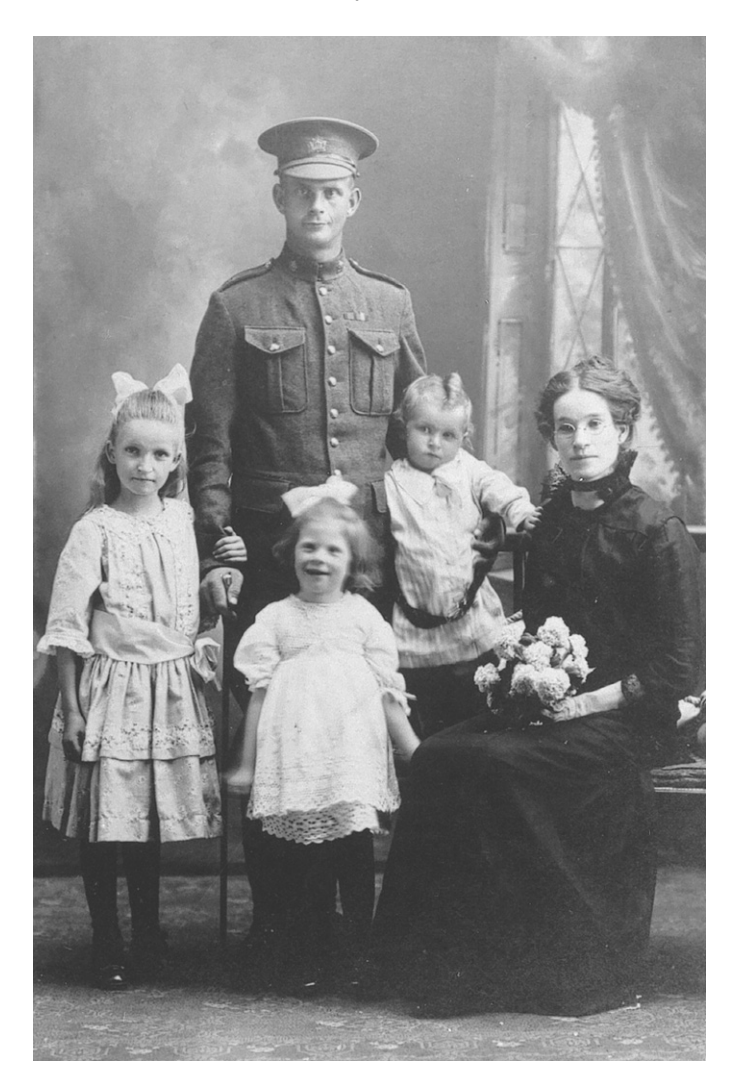
Figure 2 Father Leaving Family: Although this particular conjugal family portrait survives anonymously, it typifies a scene many families sought to preserve for posterity. As recorded moments, such portraits marked a popular, purchased, framing of the domestic sphere before the killing began.

Bank at Ottawa." He added that his "insurance policies are all with Ainslie Greene 5–8 Primrose Ave. of Ottawa also my will which he made out for me. I left a trunk at 261 Laurier West — containing some photos jewelry etc. There were also a number of books. I think that's about all...." The rest shifts back to details of an unfolding adventure, picked up in later letters, of his journey overseas to England, exciting London, training in Kent, a glimpse of the French coast. He could hardly wait. At this point, though, the parades