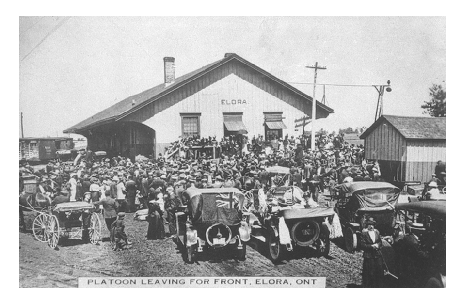
Figure 3 Platoon at the Platform: Prepared as a commemorative postcard, this scene shows the crowd and parked cars jammed at the railway station for a final send-off in Elora, Ontario, near Guelph, in August 1914. A farewell dance had been held there shortly before. Such last glimpses served, for troops and well-wishers alike, as intimate encounters between local pasts and uncertain wartime futures.

and rallies in Guelph had brought him little farther than a stay with family friends near his unit's current base. From there, near the shores of eastern Lake Ontario, he imagined finally getting to the "big show" in France: