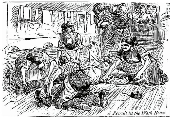
Figure 1 Detail E

Women also sewed and cooked for their own families, or even occasionally for pay. 50 Single soldiers ate in a “mess” system together, but, perhaps in keeping with new ideas being introduced about the importance of domestic life, even though it seems impractical, married couples ate their meals in family units. 51 Every day in a single open barracks room, there would be the bustle and commotion of numerous individual breakfasts, noon dinners (the main meal), and evening suppers being prepared. This arrangement goes a long way to explain all of the domestic articles found on site at Fort Wellington. The presence of women in barracks added greatly to the well-being of the men there. Not only did women cook and clean, but they often added to the communal resources from their earnings. For example, the Report on Barrack Accommodation noted that women often made up shortages of such essentials as coal. “If a married woman lived in the room with the men, she always contributed her portion,” it was noted. 52