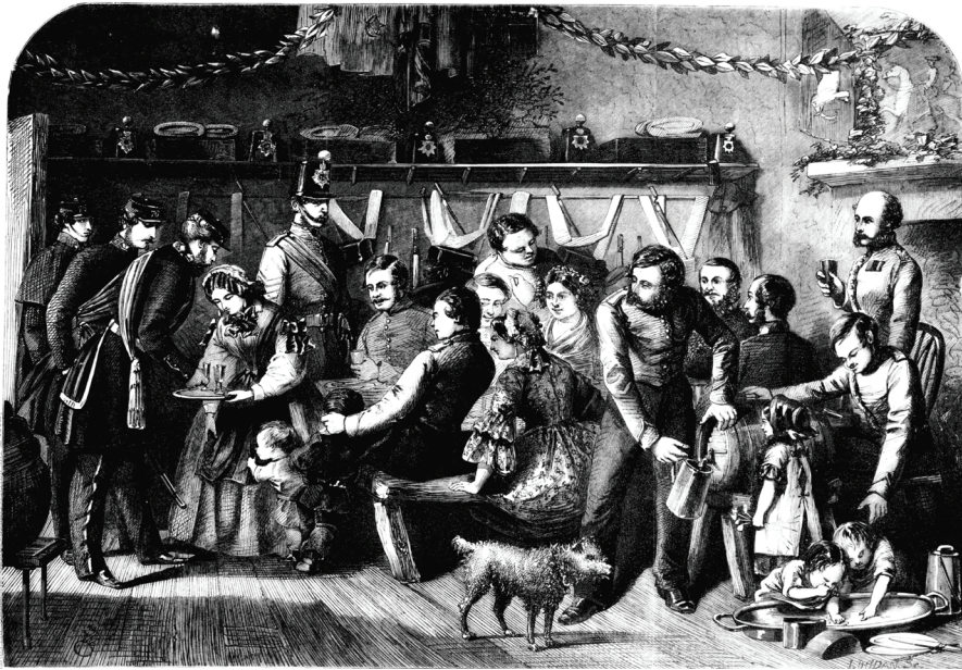
Figure 2: “Christmas Day in Barracks” by W. Smart.