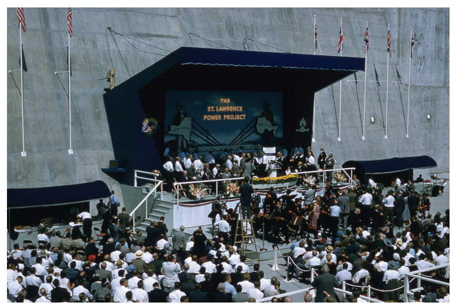
Figure 7: Opening ceremonies for the Moses-Saunders Power Dam.

The party then proceeded to the Eisenhower Lock, at which point members disembarked to travel to the PASNY reception centre at the Moses-Saunders Power Dam, and then a ceremony at the middle of the dam itself. The Queen unveiled a stone marker at the international border, bisecting the powerhouses, which read: "This stone bears witness to the common purpose of two nations whose frontiers are the frontiers of friendship, whose ways are the ways of freedom, and whose works are the works of peace." The wording had been the subject of much contemplation, and the final result took the form of a not-so-subtle jab at the Communist empire.<sup>47</sup> Lunch followed for the Queen in Cornwall, then a driving tour with short stops on the Ontario side at Long Sault, Ingleside, Morrisburg, and Iroquois, where she reboarded the royal yacht and proceeded to Brockville. This four-day tour attracted many sightseers eager to grab a glimpse of the monarch, who put on a good show despite her advanced pregnancy.