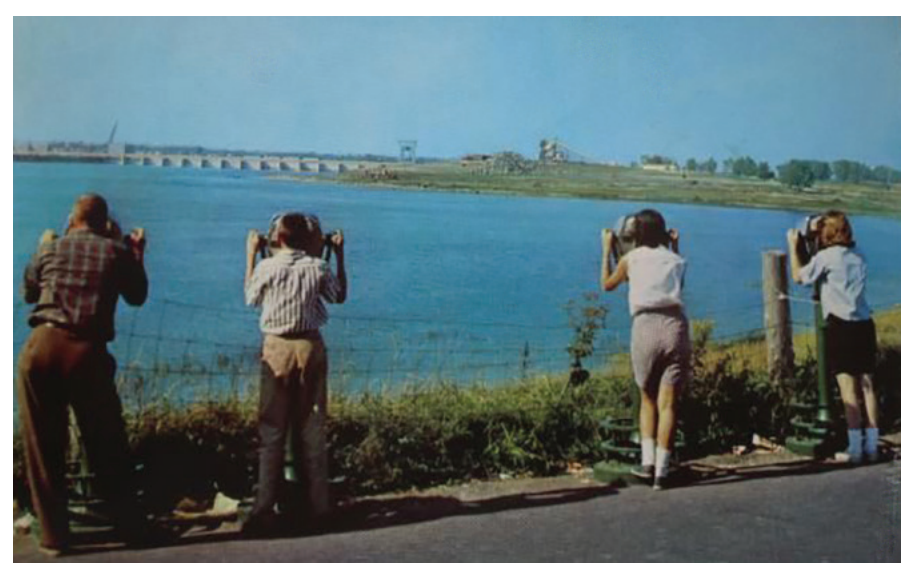
Figure 5: Tourists viewing the Iroquois Dam, 1958.

40 For an elaboration of this argument about an "all-Canadian Seaway," see Macfarlane, Negotiating a River.