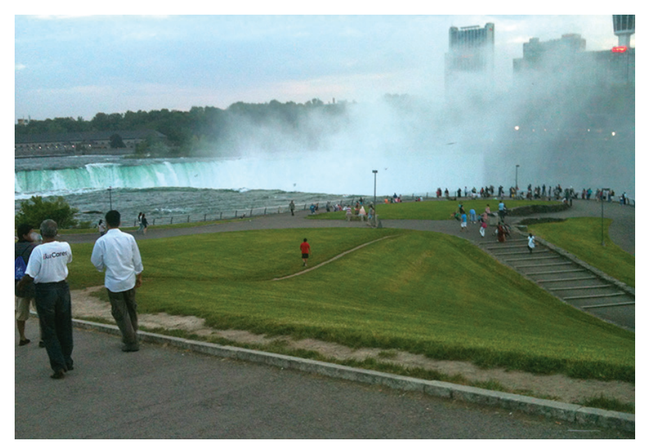
Figure 3: Tourists at Terrapin Point, 2012.

Parts of these crest fills were fenced and landscaped to provide prime public vantage points: on the Canadian side, Table Rock was reconfigured to offer an enhanced perspective for visitors to the Horseshoe Falls, and the same was done at Terrapin Point on the American side. Extensive scale models were the primary means by which the form and location of the remedial works were selected, and the models themselves became tourist attractions.<sup>29</sup> Long cofferdams shunted the water away from construction, and viewing stations were created so that the public could observe the dry waterfall and other aspects of the work in progress.