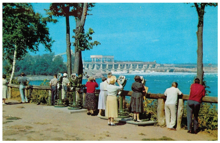
Figure 4: PASNY lookout.

and fed by hydraulic nationalism that framed the St. Lawrence as an exclusively "Canadian" river—attempted to go ahead with an "all-Canadian" Seaway entirely on the north shore. However, American pressure eventually induced Canada to acquiesce in a joint St. Lawrence Seaway and Power Project, and a bilateral agreement was achieved in 1954.<sup>40</sup>