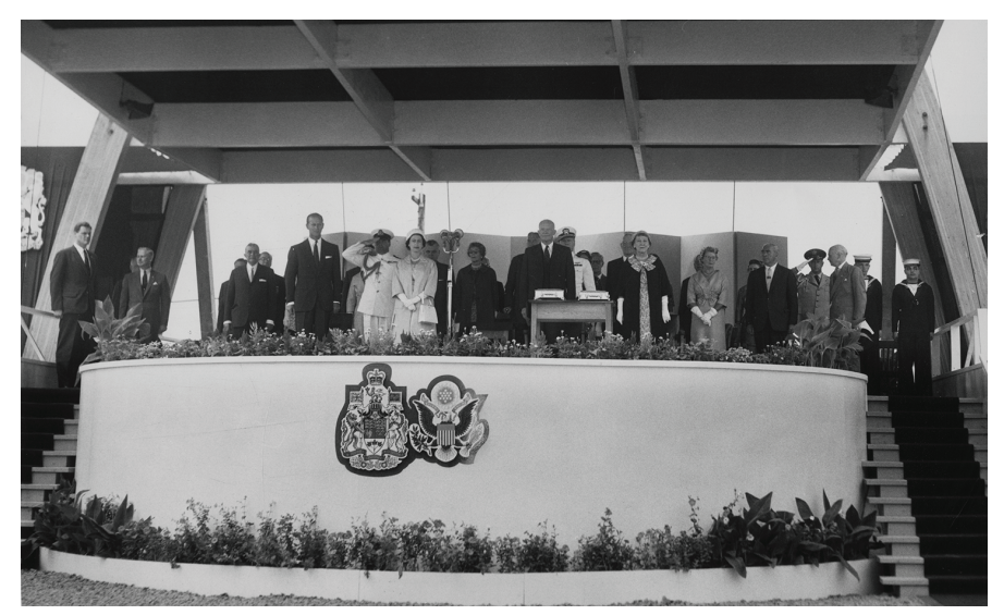
Figure 6: Opening ceremonies for the St. Lawrence Seaway.

The celebration of the opening of the Seaway the following year was not only larger than the opening of the power phase, but a much more elaborate spectacle than the public commencement of the Niagara project. A bi-national working group was formed to oversee the joint international Seaway opening ceremony, and architects were hired to assist in the planning and stage-managing of every aspect of the ceremony.<sup>44</sup> While Inundation Day in 1958 had been open to the wider public, people from the flooded areas were largely excluded from the 1959 opening celebrations, which were reserved for invited guests and dignitaries. The ceremonies were timed to coincide with the visit of Canada's new queen, Elizabeth II, and organizers orchestrated a packed itinerary to highlight the roles of the various participating political entities. During a half-hour ceremony at the Saint Lambert Lock, the Queen and US President Dwight Eisenhower were each given a book bearing the names of almost 60,000 people who had been involved in creating the St. Lawrence project. The dignitaries delivered speeches affirming the grandeur of the project.<sup>45</sup> Afterward, the Queen and President boarded the royal yacht Britannia and entered the lock, accompanied by a crescendo of fireworks, bells, sirens, and gun salutes, embarking on a five-hour escorted cruise to the Lower Beauharnois Lock.46