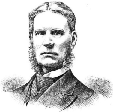
Figure 3: ‘Augustus Morris’, Australian Men of Mark, Vol. II, Sydney: Charles F. Maxwell, undated, 304 (Accessed 4 November, 2013). Available from: ncb.anu.edu.au/sites/.../documents/Australian-Men-of-Mark-Vol.2.pdf