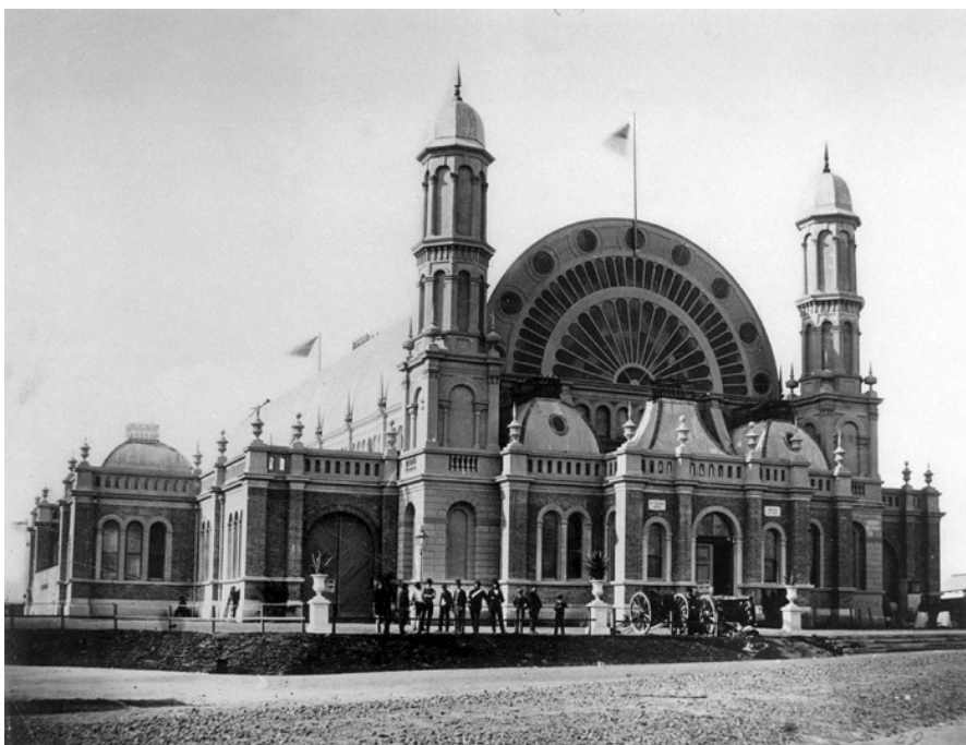
Figure 2: Exhibition Building, Metropolitan Intercolonial Exhibition, Prince Alfred Park, Sydney, September, 1870.

the Australian colonies seemed to demonstrate a particularly deep-seated passion for this form of cultural and commercial expression. 19 From an early start experimenting with small displays and shows in Mechanics' Institutes, the cities of Sydney and Melbourne each organized a series of well-attended intercolonial exhibitions. These were still local fairs with the emphasis on livestock displays. 20 This considerable activity culminated in upgrading both the Sydney and Melbourne venues into international shows: the Sydney International Exhibition in 1879 and the Melbourne International Exhibition in 1880. Sir Redmond Barry, chairman of the fair commissioners for the Melbourne fair of 1875, underlined the importance of exhibitions from a uniquely Australian vantage point, emphasizing the need for residents of the Antipodes to act in unity or, as Barry stated, "to concentrate the united efforts of our fellow-colonists with ours, so as to impart to them the characteristics of a national movement." 21 While the Australian colonies were engaged in this domestic expository zeal, they were often recycling the same display materials assembled for the important nineteenth-century international fairs held in London, Paris, and Philadelphia.