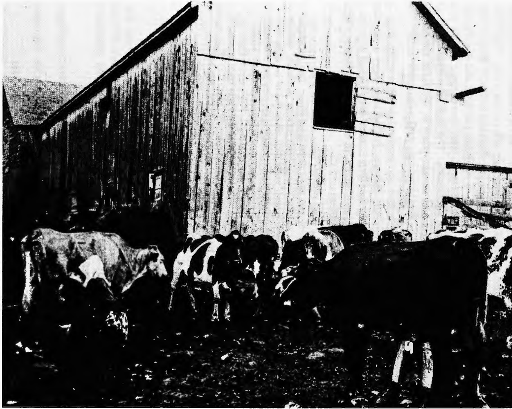
Milking the cows, Ontario, circa 1900