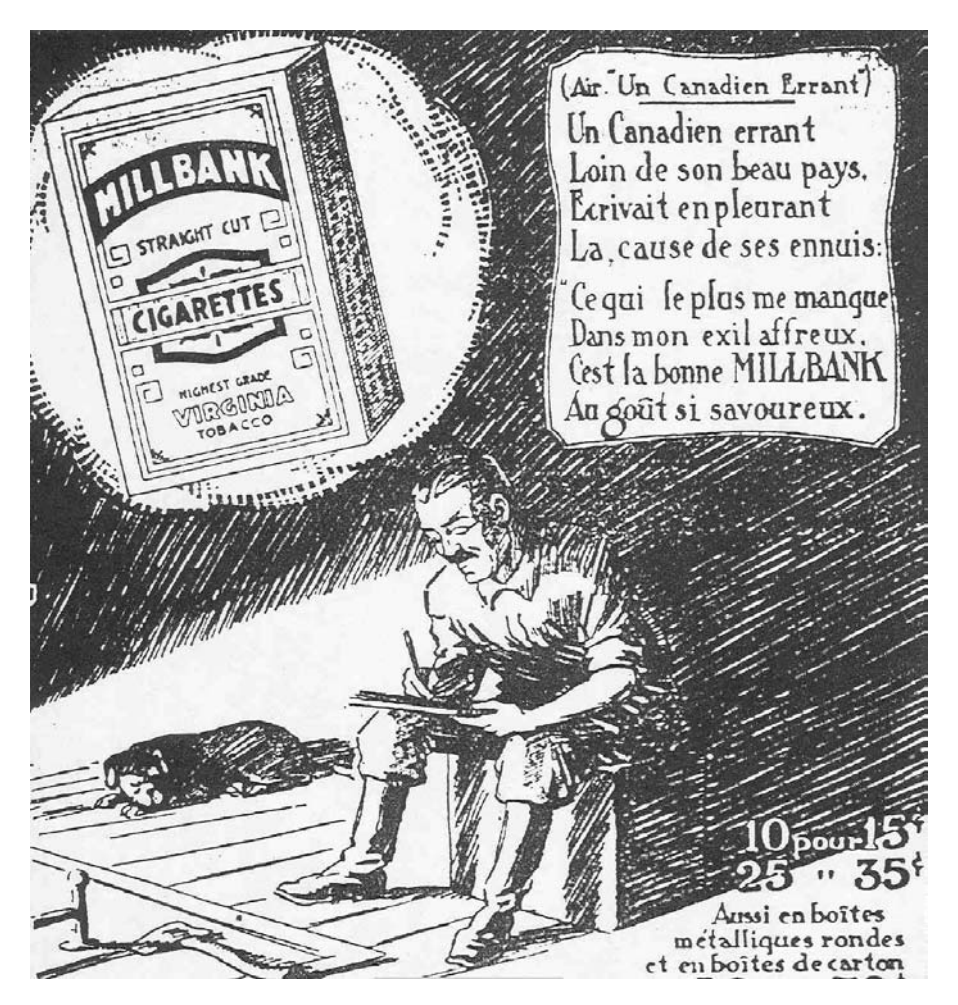
Figure 10: An ad for "Millbank" cigarettes adapts a French-Canadian folksong to market its product ( Le Soleil , April 21, 1924, p. 3).

town Quebec Poussière sur la ville (1953) and Gabrielle Roy's Alexandre Chenevert (1954), set in Montreal, cigarette smoking is rampant and no one smokes tabac canadien . When the enormously popular televised version of Les Plouffe (1953) hit the airwaves, Imperial Tobacco was the main sponsor, and Roger Lemelin made sure that the company's cigarette brands were strategically placed in the show.<sup>89</sup>