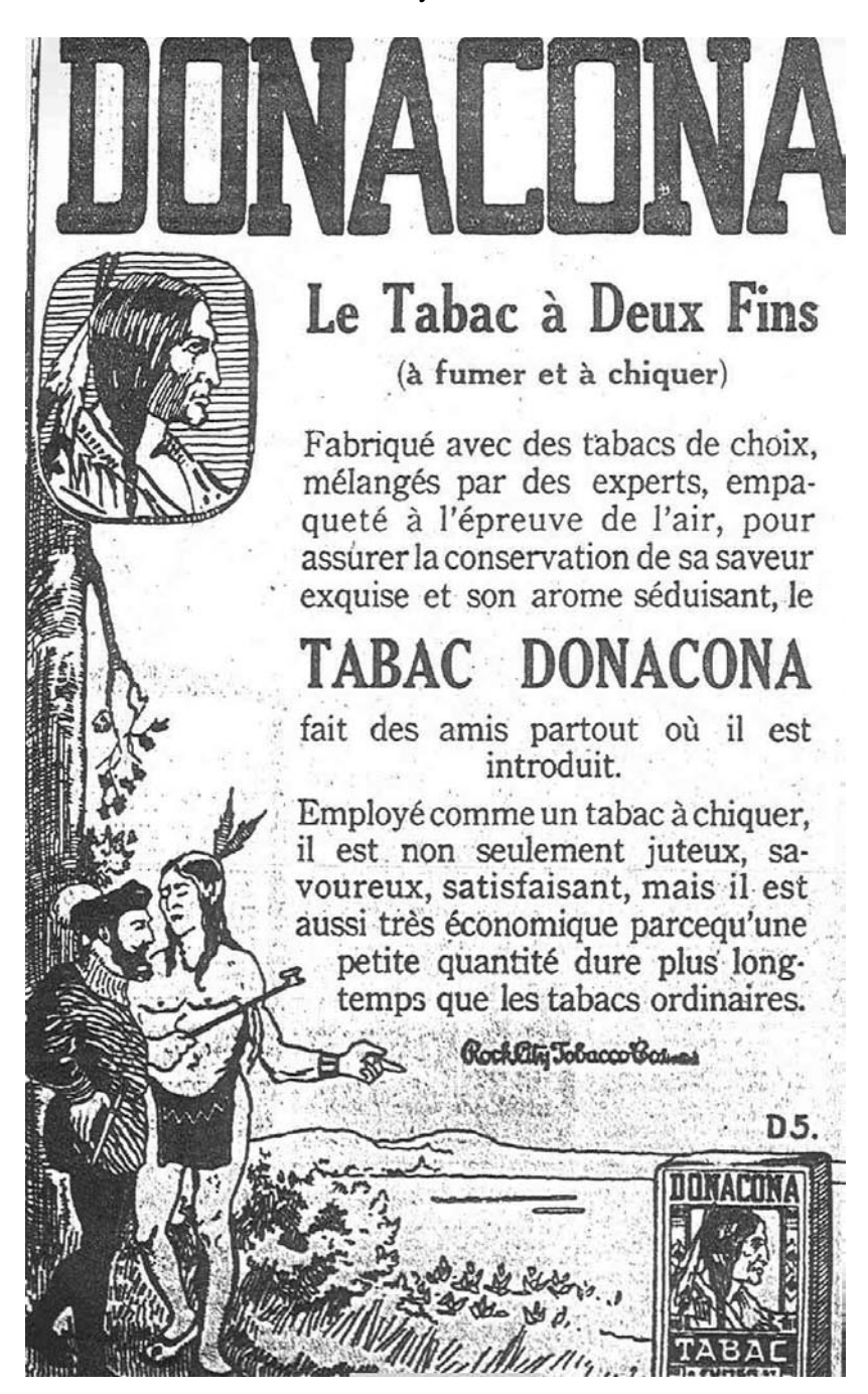
Figure 5: Rock City drew heavily upon French-Canadian culture to claim its authenticity. In this ad, a Native man (presumably Donacona) chats with a European (presumably Jacques Cartier) ( Le Soleil , April 16, 1923, p. 8).