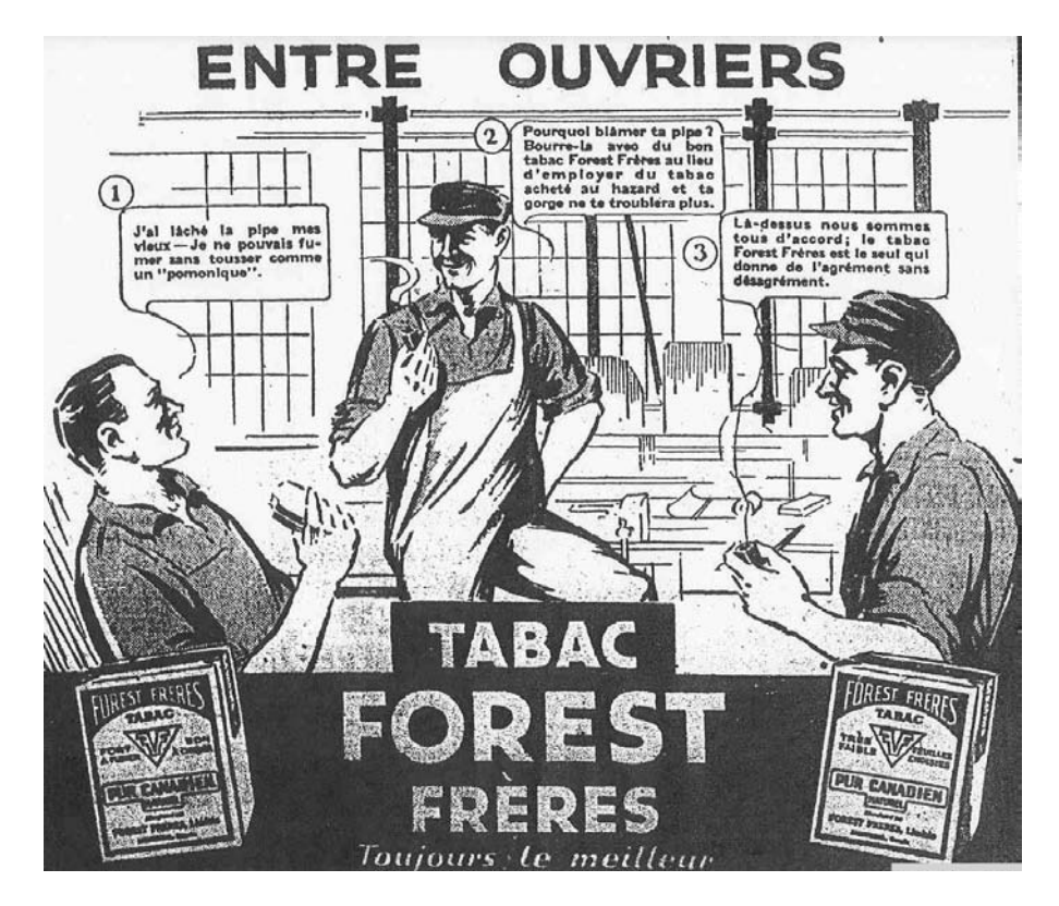
Figure 3: A Forest Frères ad features working men discussing Forest Frères tobacco, noting that it did not hurt the throat the way other tobaccos did (Le Soleil, April 20, 1931, p. 16).

ical strength of the smoker. According to this reasoning, a natural barrier existed, stopping physically immature boys from smoking (since it was thought that they would get sick because the tobacco was too strong) and maintaining that women could not smoke safely (since they purportedly did not have the strength of will to avoid an unhealthy addiction).<sup>63</sup> Indeed, another advertisement for the same strength of tobacco showed a woman taking a drag from her husband's pipe. The husband, somewhat shocked, looks up from his newspaper and says, "Oh! My little wife, you are smoking! Good thing it is Forest Frères' mild tobacco!" (Figure 4). 64 In both of these cases, the tobacco is presented as being so light that even unhealthy or weak-willed smokers (men and women alike) could puff away to their heart's content.