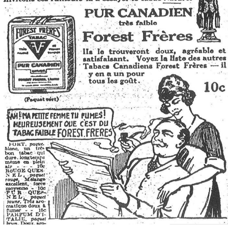
Figure 4: "Oh, my little wife, you are smoking! Good thing it is Forest Frères' mild tobacco!" The tobacco is presented as being so light that even a woman could smoke safely ( Le Soleil , March 15, 1923, p. 9).

Il existe une classe de fumeurs qui ne veulent pas fumer de tabac Canadien pur, parcequ'ils croient que tous les tabacs canadiens sont forts. Nous invitons ces fumeurs-là à essayer le tabac Naturel