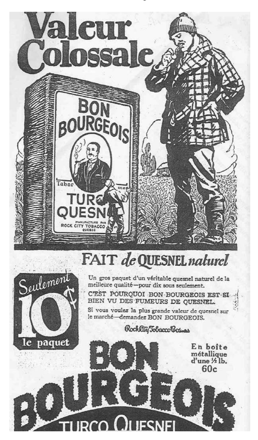
Figure 6: Rock City's "Bon Bourgeois" tobacco ad depicts a modern, well-to-do farmer in his field and, on the package, in his Sunday best (Le Soleil, May 2, 1923, p. 2).