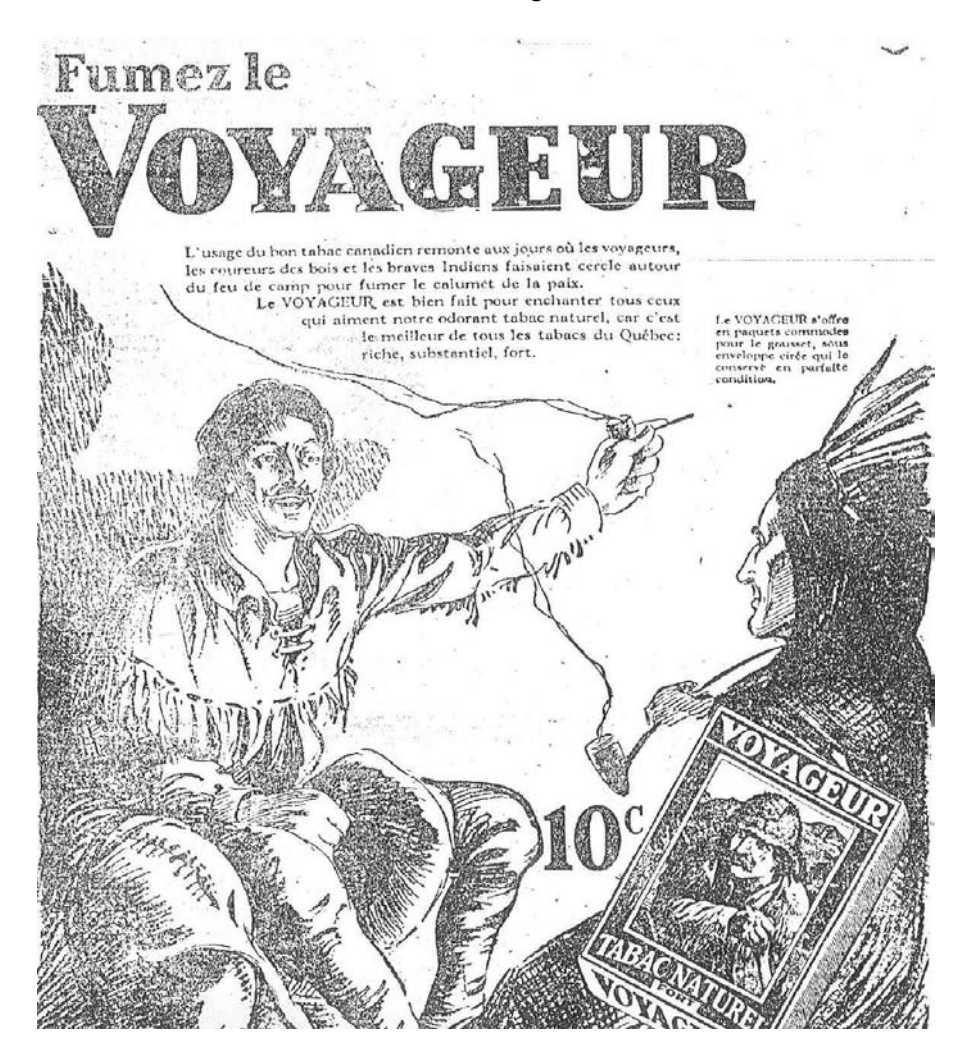
Figure 9: A series of ads for B. Houde's brand "Voyageur" included images of Natives and voyageurs smoking the peace pipe ( La Presse , July 30, 1930, p. 19).

evokes the Romans, and visions of robust, virile men", its publicity claimed.<sup>79</sup> This series of ads included images of Natives and voyageurs gathered together "around a camp fire to smoke the peace pipe" (Figure 9).<sup>80</sup> The play on words in this advertisement conflates the depicted voyageur with the brand name of the tobacco. The voyageur, profoundly French Canadian like the