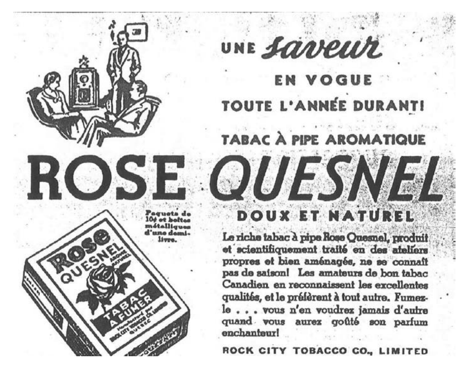
Figure 7: Modern social settings were depicted in the corner of Rock City's ads for "Rose Quesnel" tobacco, in this case people listening to the radio, with men smoking in the presence of women (Le Soleil, March 7, 1936).

images used in its advertising were of a modern, well-to-do farmer shown both in the field and in his Sunday best on the package label.<sup>69</sup> The modern characteristics of advertising for tabac canadien are also found in Rock City's leading brand of French-Canadian tobacco, "Rose Quesnel". The name "Quesnel" sufficed to identify it as a French-Canadian tobacco and the small images in the corner of each advertisement depicted modern social settings.<sup>70</sup> The example from 1936 (Figure 7) is particularly modern, showing people listening to the radio. Moreover, men are smoking in the presence of women, a practice viewed as a social faux pas until at least after World War I.