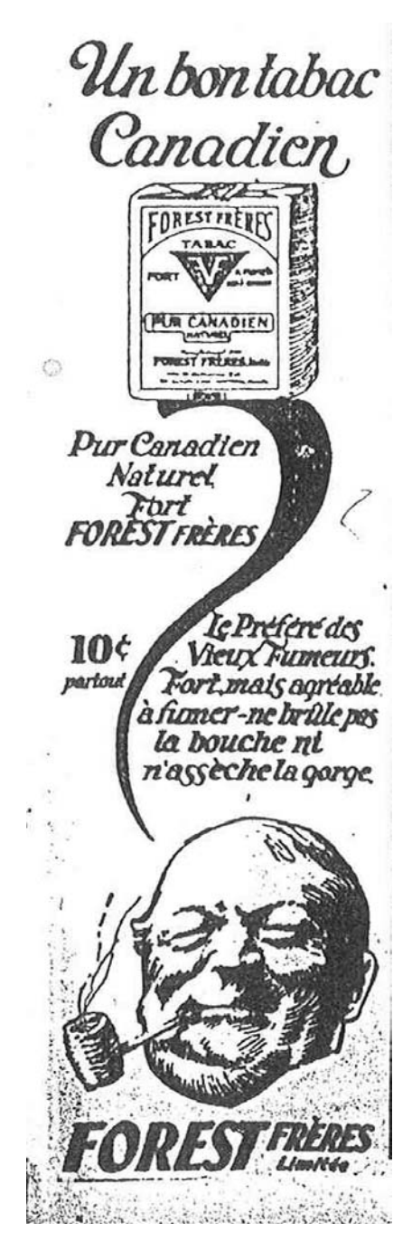
Figure 2: One ad for Forest Frères "Fort" tobacco featured a sketch of an older man with a corncob pipe, with the slogan "The preference of old-time smokers" ( Le Soleil , April 12, 1924, p. 27).